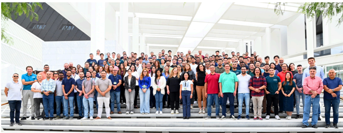
KIOS Research team, October 2025

More information: https://www.kios.ucy.ac.cy/