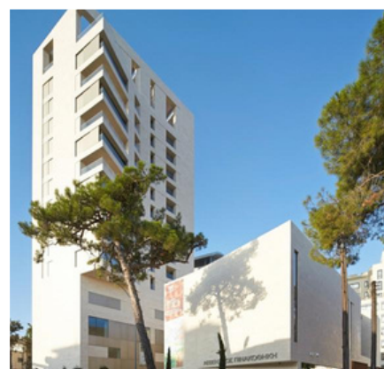
A.G. Leventis Gallery

Nicosia enjoys a Mediterranean climate with long dry summers from mid-May to mid-October and mild winters from December to February, which are separated by short autumn and spring seasons. In March, the average temperature ranges from 19-20 °C during the day to 7-10 °C during the night in Nicosia. See Cyprus Weather for more details.