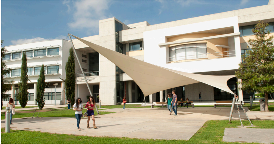
University House, Anastasios G. Leventis